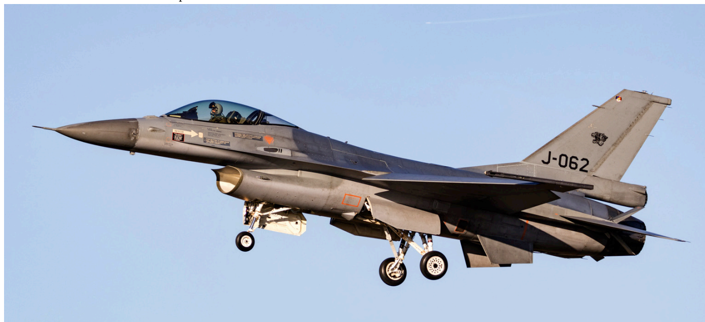
After more than 3 years being used as donor for other F-16AMs on Volkel airbase, F-16AM J-062 was moved via a trailer in August 2019 to Woensdrecht for maintenance at LCW. This Monday it made its first flight since 2015 (note the different 313sq badge and the additional 900sq badge on top of the tail). It is still on Woensdrecht today. (23 November 2020, Joe Peartree)

In November 2019 the first two H145s were delivered to the Magyar Légierő, followed by another two in December 2019 which makes it four in total for 2019 which is exactly according to the delivery schedule. This delivery schedule mentions that there should be twelve H145s delivered in 2020 which means that one needs to be delivered in the coming month. The last four should be delivered in 2021. Serials 05 and 06 are being used as training helicopters and are supposed to be the last two that are going to be delivered.