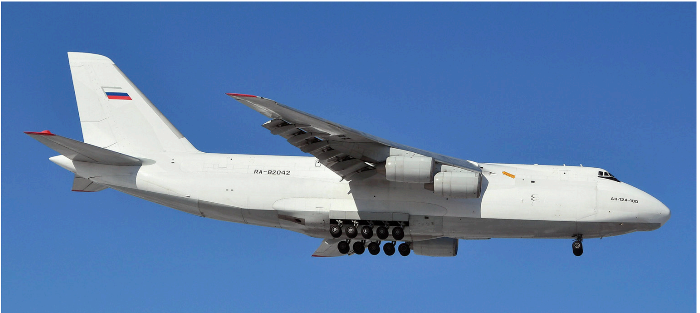
Captured on Valentine's Day this year (so 14 February for the less romantic inclined) is Volga-Dnepr Antonov 124 RA-82042, coming in to land at Toronto-Lester B. Pearson International Airport (ON). Almost nine months later, on 13 November, it suffered an uncontained engine failure, resulting in a crash landing at Novosibirsk-Tolmachevo Airport, Russia. It was operating flight VI4066 from Seoul-Incheon to Vienna-Schwechat, with a planned stop over at Novosibirsk. It was leaving for Vienna when the accident happened.

vived and was evacuated. The crash has been attributed to a technical failure rather than any form of foul play, including militant activity. This unit is supporting the MFO, an international peacekeeping force tasked with overseeing the peace treaty between Egypt and Israel.