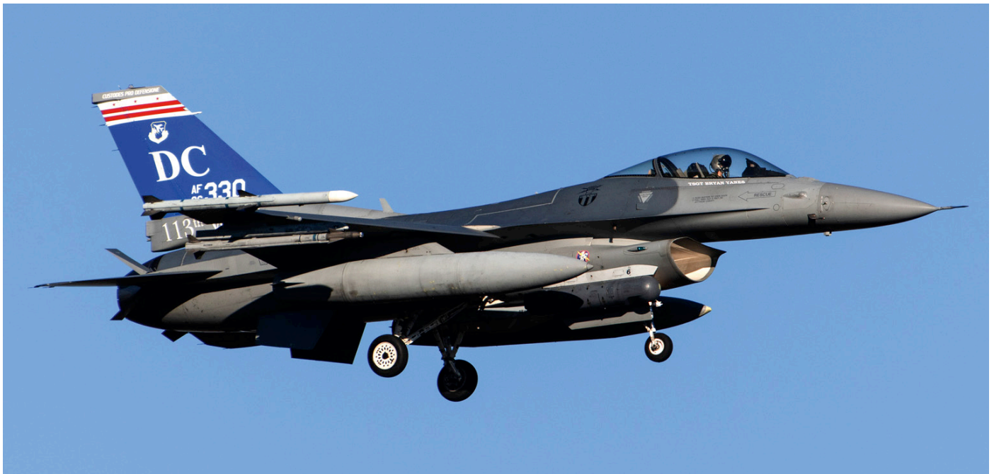
Colourful (or colorful?) markings on this District of Columbia Air National Guard 113th Fighter Wing's F-16C 86-0330 when it returns to its Andrews AFB on 9 November 2020.

helicopters to replace the HH-60G Pave Hawk.