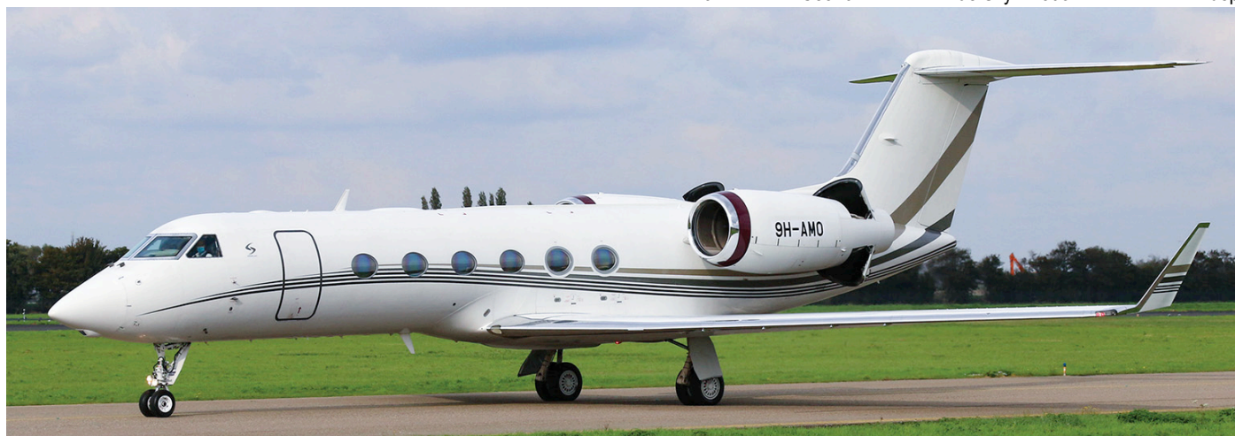
This former Metrojet Gulfstream G450 is currently operated by Elit'Avia Malta. From June 2020 until September 2020 it was registered 9H-OAM, but was reregistered to 9H-AMO in September 2020. (Rotterdam - The Hague, 13 October 2020,)