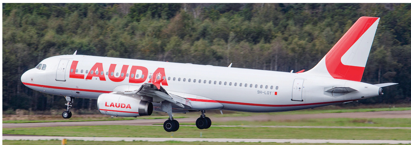
Lauda Europe is the successor of Lauda (dba LaudaMotion). The company is legally based in Malta and the result of a conflict between Lauda and Ryanair, the labour union and the Austrian government. Airbus A320 9H-LOY is former OE-LOY. (Eindhoven, 9 October 2020,)