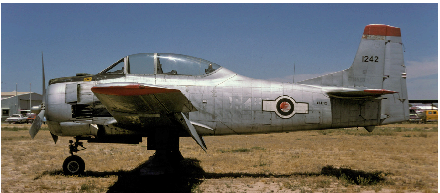
The Haiti Air Corps received at least thirteen T-28 derivatives, of which eleven were confirmed as Fennecs. Most of these were sold back to the USA for use as warbirds like this N14112 (ex 1242).