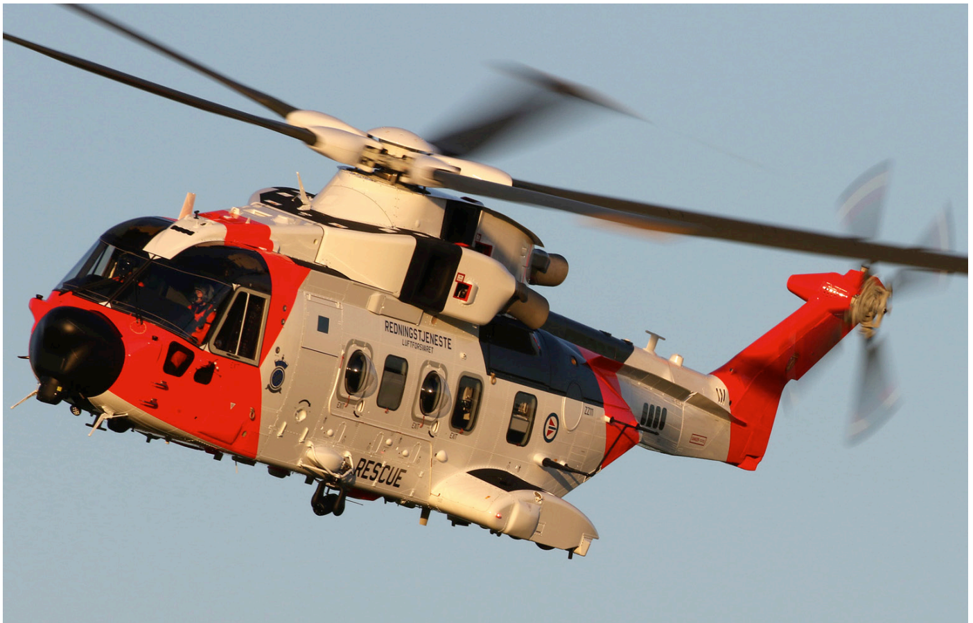
An excellent shot in beautiful sunlight was taken of this AW101 with testregistration ZZ111 (future serial 0280) on 4 November 2020 at Yeovil. This AW101 is intended for the Norwegian Air Force and took its first flight on 3 November 2020.

threatening the vital allied supply convoys from the United States.