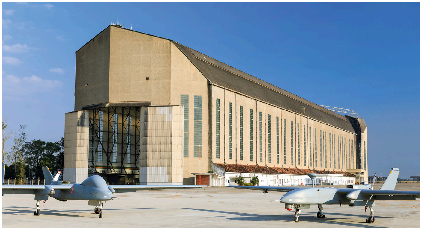
The Brazilian air force RQ-1150 is a VANT. Let us translate that... These machines are 'veículo aéreo não tripulado', or unmanned aerial systems, as we refer to them. Originally delivered as Heron I to the Federal Police and incorporated by 1°/7°Gav to operate along their P-3AM Orions. (Santa Cruz, 23 July 2020,)