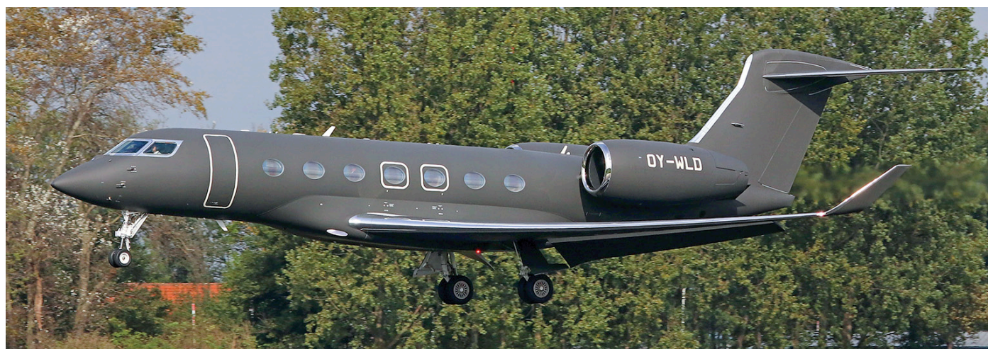
Blackbird Air Charter is a small Danish bizjet operator. Its aircraft are mostly known by the grey colours. Gulfstream G500 OY-WLD was added to the fleet in October 2019. (Rotterdam - The Hague, 13 October 2020)