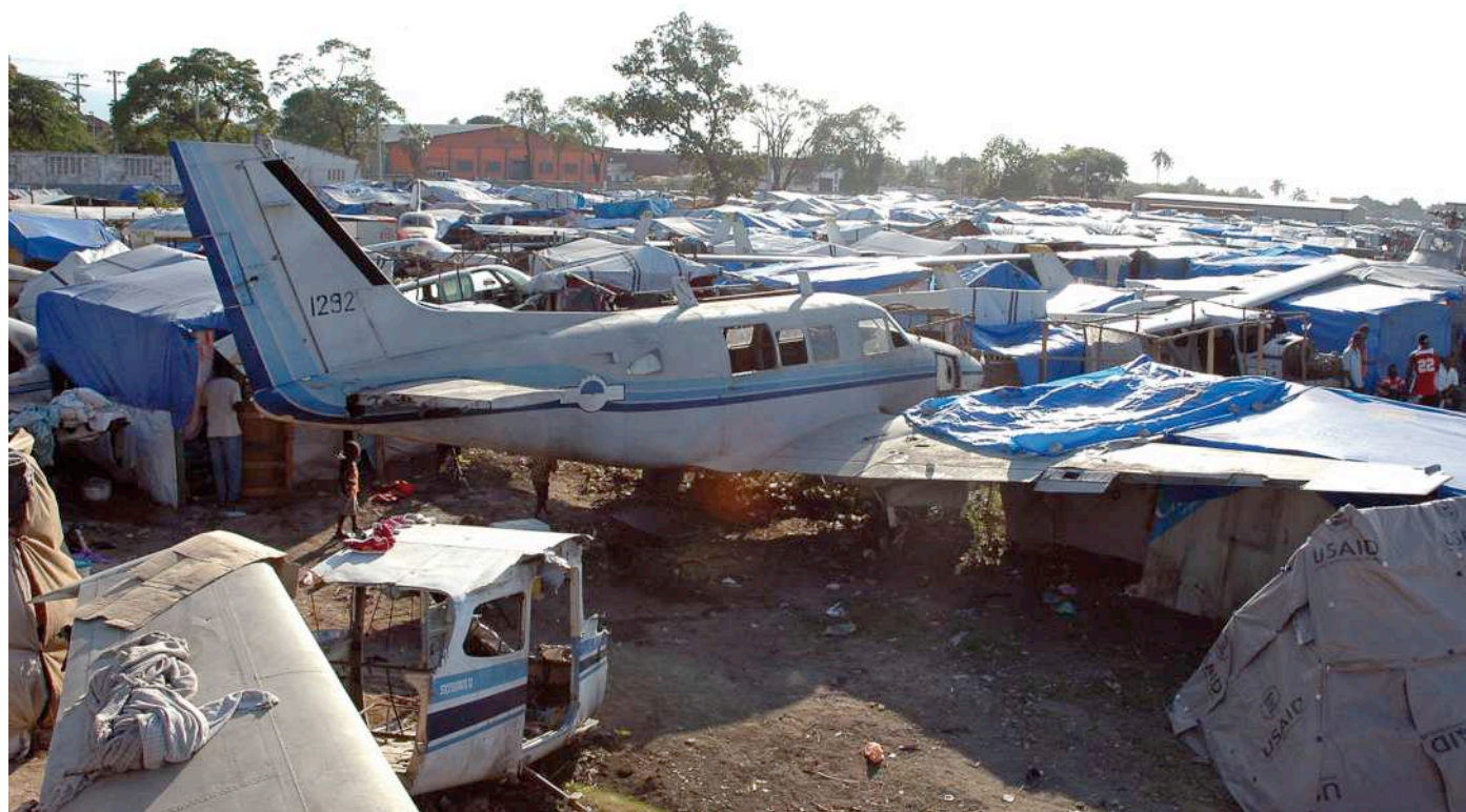
And this is how it all ended, the remaining aircraft of the Corps d'Aviation d'Haïti were used as shelters for Internally Displaced Persons (IDP) at their former home base Bowen Field (Ancient Aerodrome Militaire). Clearly seen in this picture is the penultimate delivery, Beech 65-80 serial 1292 amidst scores of other aircraft, the twin booms of the Cessna 337 coming to good use to support tent constructions. The entire site had been cleared by September 2013 (03 April 2010, Wim Sonneveld).