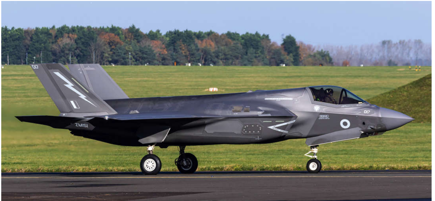
Working up the F-35 to frontline service is the main theme of this page. F-35B ZM151/017 of 617sq participated in exercise Crimson Warrior for this goal at Marham. (4 November 2020, Paul Thompson)