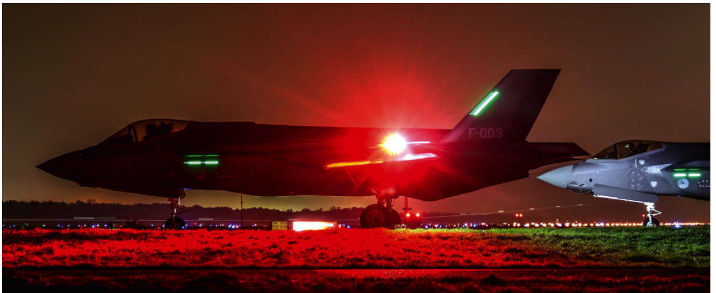
The RNLAf played its part at Volkel, where exercise Frisian Lightning II was held. This was the first out-of-area deployment of the RNLAf F-35As, with F-009 seen here. (11 November 2020,)