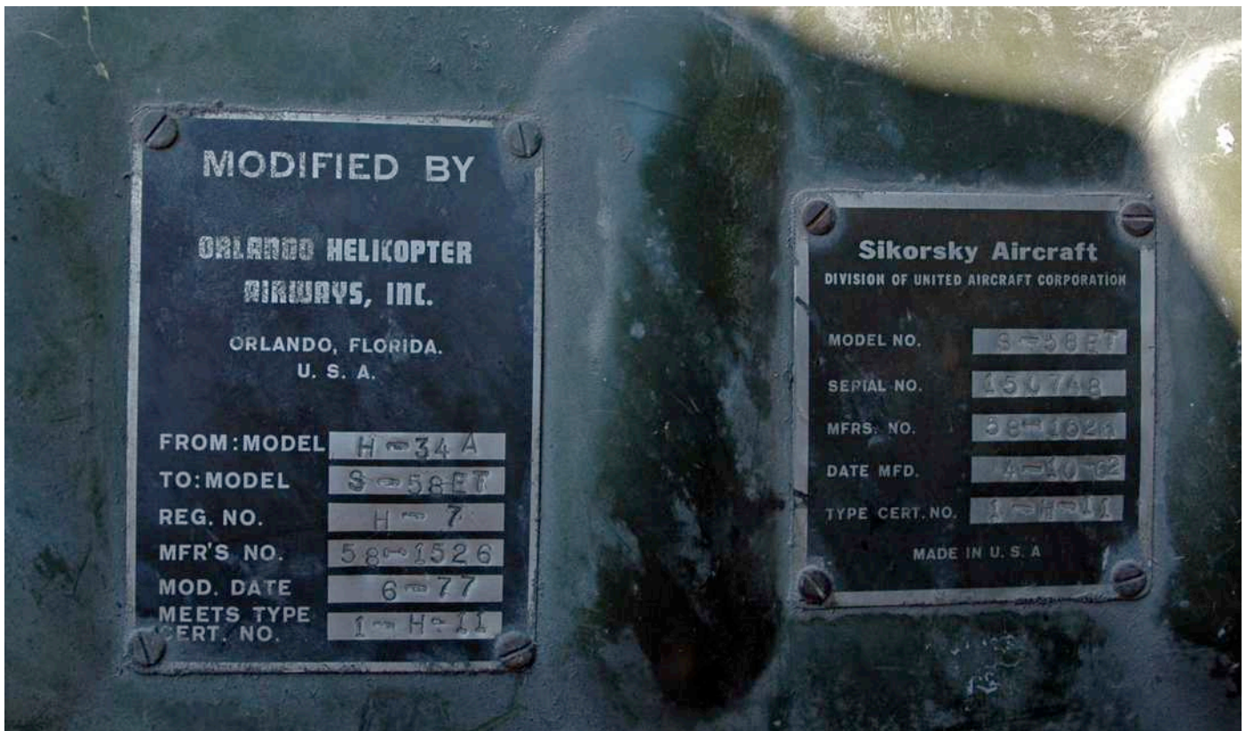
The twin construction number plates of S-58ET H-7 were photographed before the helicopter disappeared from the IDP-camp at the former Bowen Field. To the right is the original Sikorsky plate showing BuNo150748 among other data, and to the left is the plate given by Orlando Helicopter Airways after upgrade to S-58ET, listing Haitian serial number H-7. (03 April 2010,).