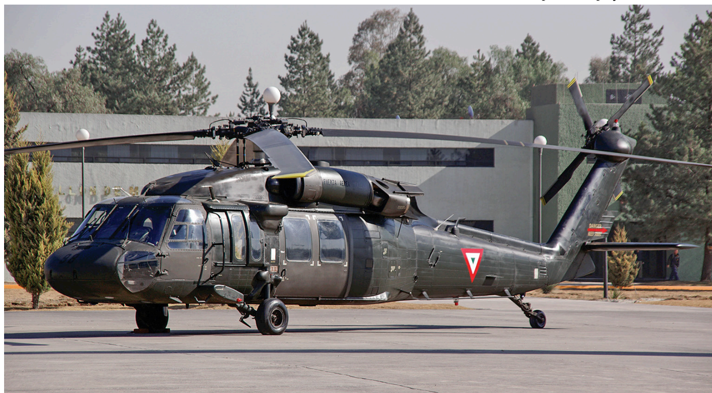
A longtime user of the Black Hawk, Mexico's EA.101 operates six of these very dark S-70A-24A, like 1098 seen here, since 1994 in support of the army's special forces. Enrique Giese saw it on air force day, 10 February 2020, at home base Santa Lucia.

115457 pres CYQQ ex 442sq 11 nov20 On 5 November 2020, 457 was put on display in the Comox Air