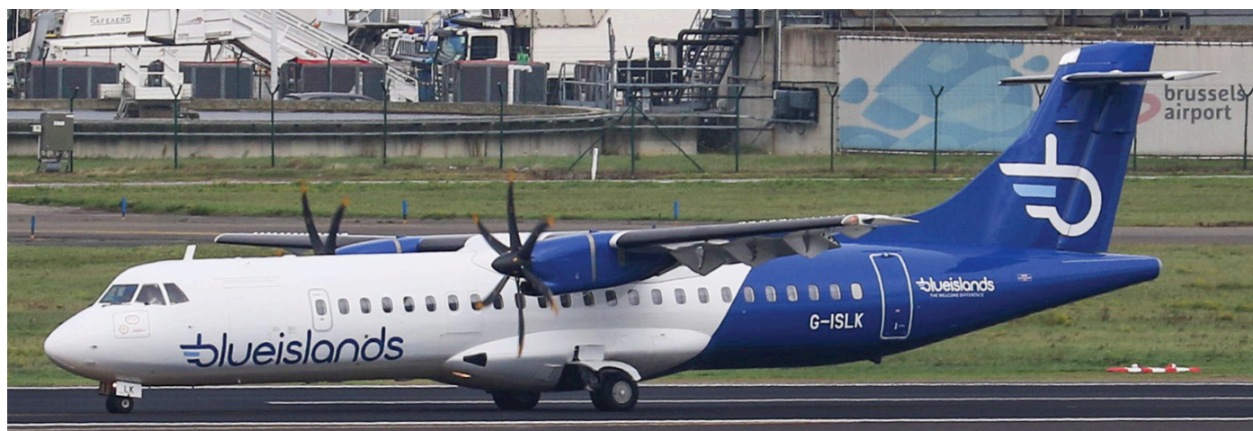
Another recent repaint took place after FlyBe ceased operations. ATR72 G-ISLK had been operating for FlyBe since October 2016. It was painted in Blue Islands colours in July 2020. (Brussels, 8 October 2020, Paul Sanders)