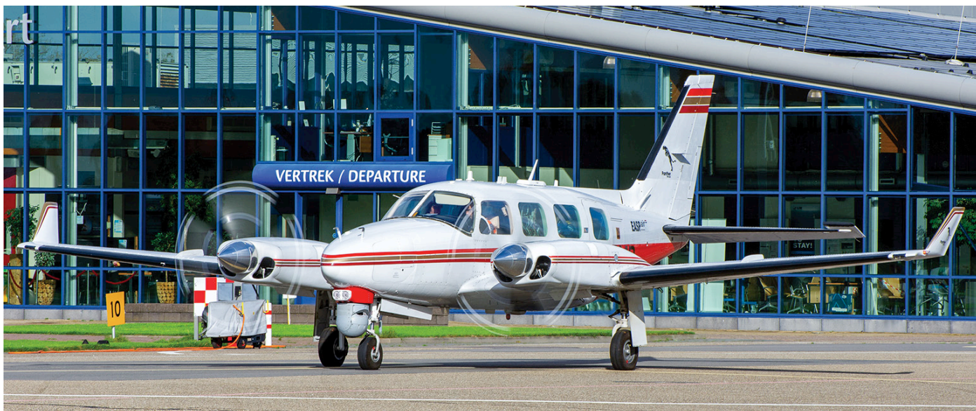
The Piper PA-31 on the photo has been operated by 2 Excel Aviation since February 2017. Dubbed the 'Panther' Maritime Patrol Aircraft, G-SCMR is being used for sensor trails in cooperation with Dutch company EASP Air. (Den Helder, 7 October 2020)