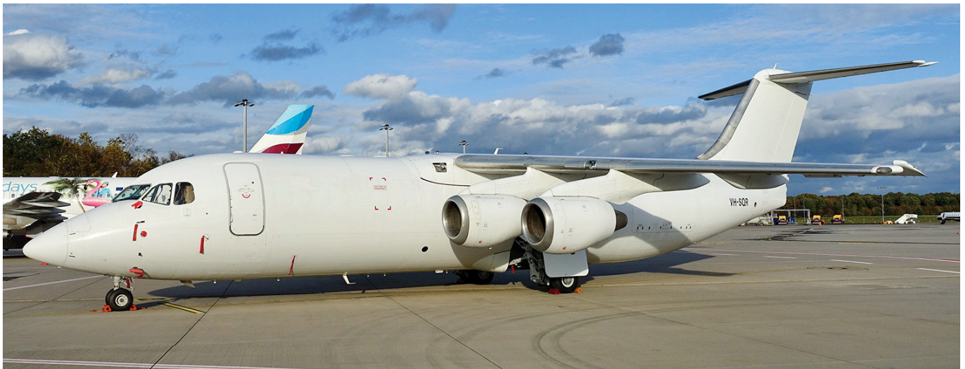
VH-SQR BAe146-300QT Pionair Australia, this gem is waiting at CGN for delivery to Down Under. Corona makes delivery complicated (a 9 stop routing!) but the aircraft left Cologne on 10 November and Arrived in Australia few days later on 15 November. It is expected for early November. (Köln-Bonn, 28 October 2020, Anton van Ruiten)