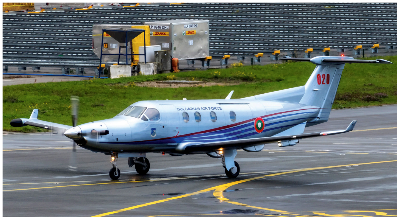
A rather rare visitor to the BeNeLux countries is Bulgarian PC-12M O20. The bizprop was converted by Pilatus from a model/45 into this version, before being delivered to the 16 Transportna Aviacionna Basa (16.TrAB) at Sofia. The unit badge is visible on the nose. (Brussels, 11 October 2020, Kenny Peeters)