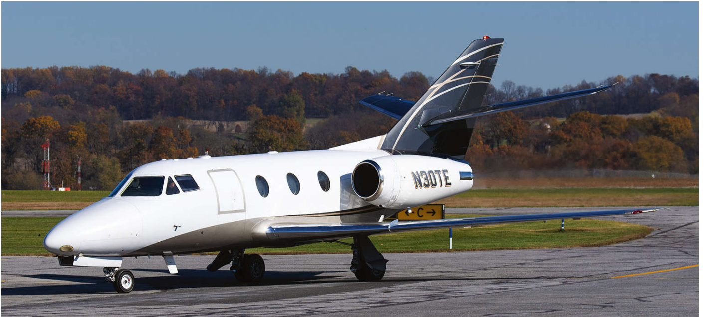
The number of Falcon 10s still active in the world is dwindling, therefore it is nice to see one still active. N30TE (c/n 152) was born in 1979 and has been active in the US, Japan, Sweden and France. (Frederick (MD), 7 November 2020,)