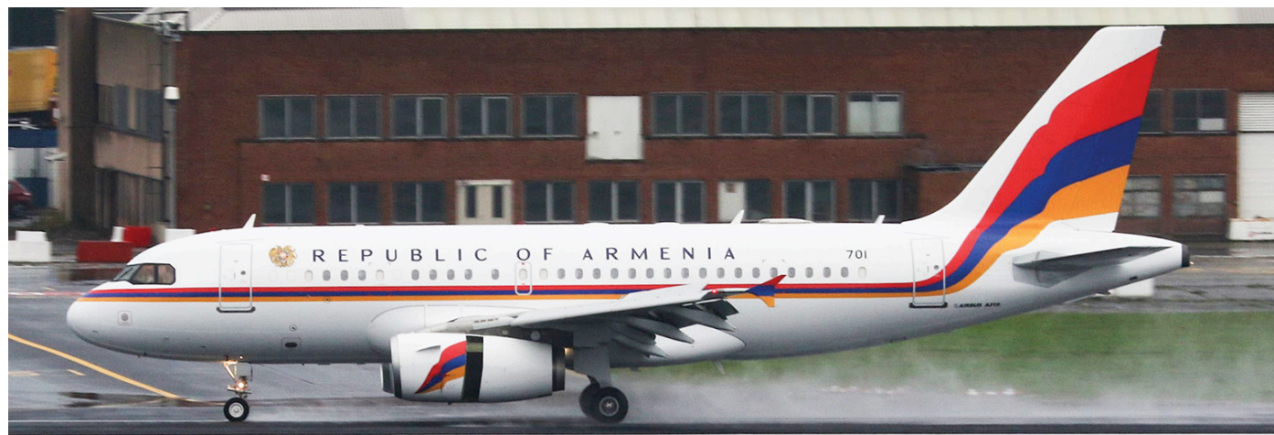
Airbus A319 with serial 701, operated by the Government of Armenia, has recently been repainted. (Brussels, 21 October 2020)