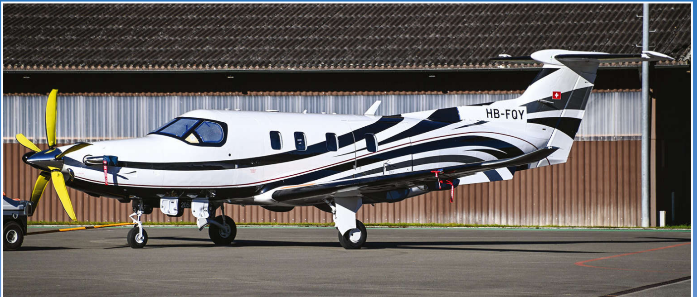
PC-12 NGX HB-FQY ,to be N928PG, is resplendent in what almost looks like a zebra-inspired colour scheme. (13 November 2020)