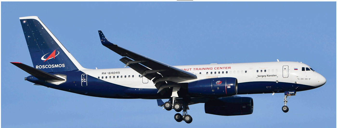
RA-64045 Tu-204 Roscosmos with extra Cosmonaut Training Center titles, arrived at Köln-Bonn as flight CPK9803 from Chkalovsky near Moscow. It brought a group of Russian cosmonauts, that continued their journey on a Gulfstream 5 (N280PH) to Houston-Ellington. (7 November 2020,)

Corendon Europe Corendon Europe German Airways a/w ADAC Privilege Style SwiftAir ASL a/w Panaviatic CargoAir Josephine Atlas Air Luxaviation Germany Roscosmos SprintAir SprintAir Pionair Australia SwiftAir