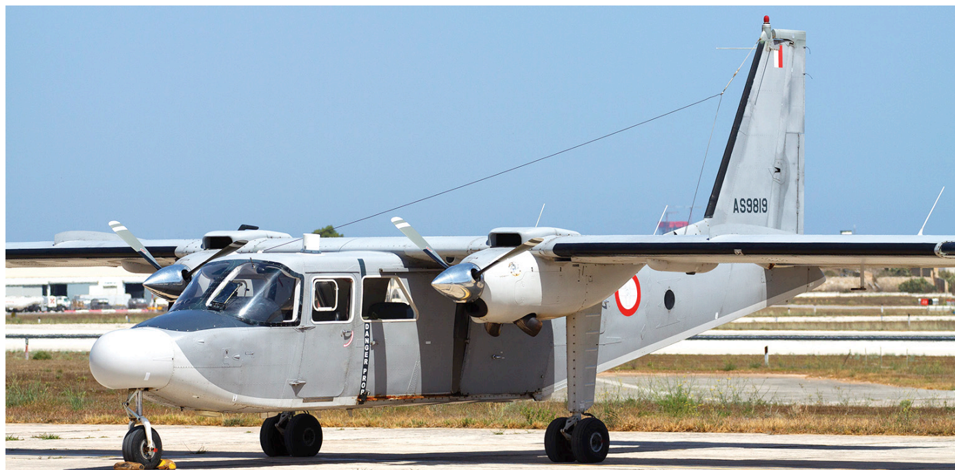
This Islander with serial AS9819 will be getting a major overhaul to extend its lifetime. Unfortunately, its brother will not be flying anymore. (31 August 2020,)

In 2019, the transition to night vision started for rotary pilots which is also a big game changer for the SAR tasks.