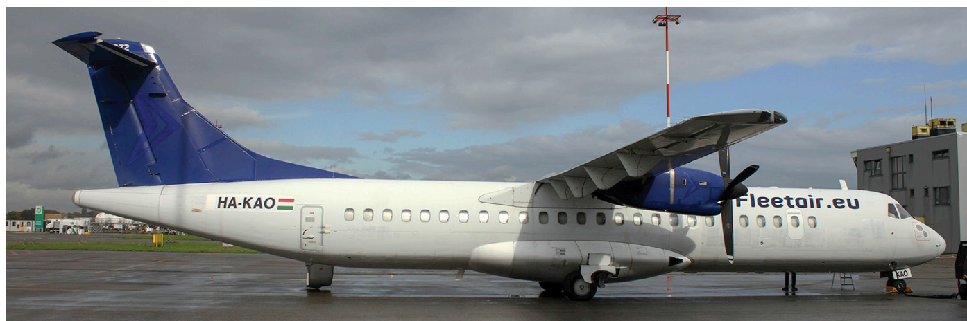
This ATR72 was acquired by Fleet Air BG in January 2020. In July 2020, it was transferred to Fleet Air International as HA-KAO. (Antwerp, 7 October 2020)