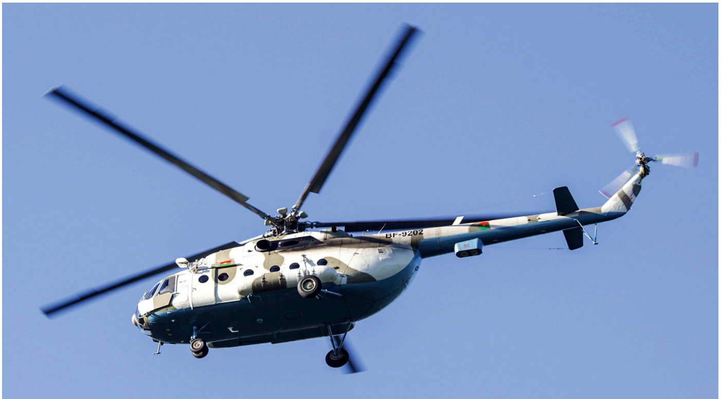
Burkina Faso Mi-17 BF-9202 is currently present for heavy maintenance with the LOM Praha facility at Kbely Airport. On 6 November 2020, this Hip was photographed during one of her post-maintenance testflights at Kbely Airport. (6 November 2020)