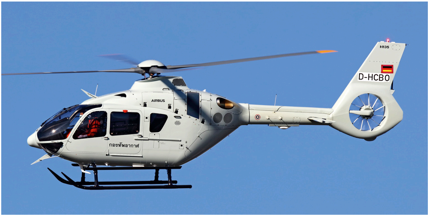
Another H135 visited Manching for a testflight out of the Airbus Helicopters facility in Donauwörth. H135T3H, registration D-HCBO is the second H135 already active with Airbus Helicopters. In February 2020, the Royal Thai Air Force signed an order for six H135s and will use the helicopters for basic helicopter training. (18 November 2020, Dietmar Fenners)