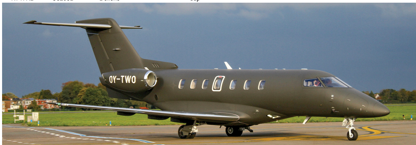
Well-known for its distinctive grey colour, PC-24 OY-TWO is part of the Blackbird Air Charter fleet. (Antwerp, 18 October 2020, Walter Van Brempt)