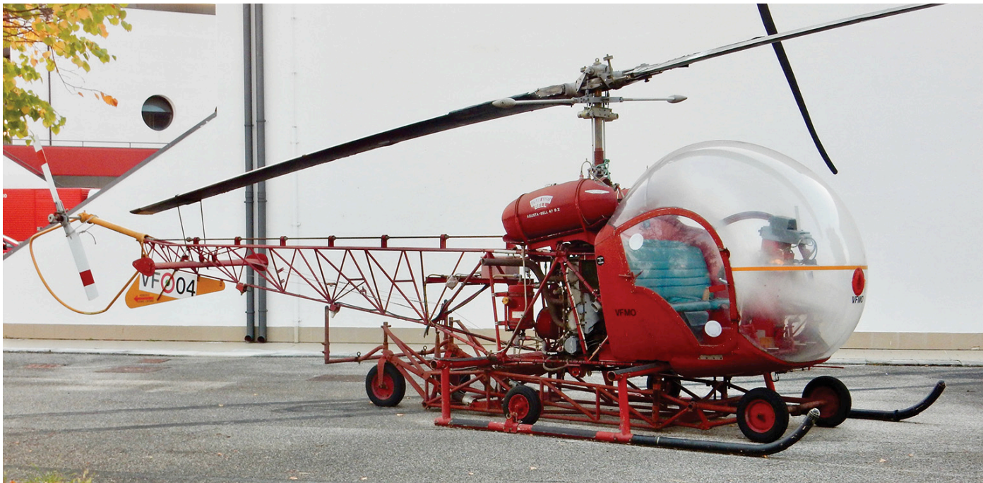
Updating Scramble 499's info about Marghera. AB47G-2 VFM0/VF-04 is not stored, as can be seen from this picture by Hans van der Vlist on 23 September 2020, but is preserved. A more accurate location for the VVF training facility is reported as Venezia Mestre.