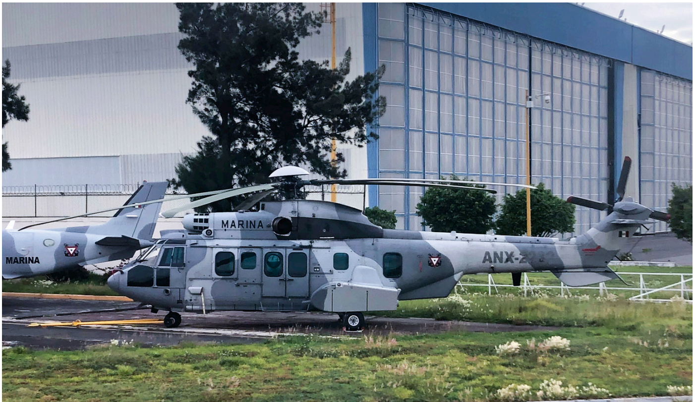
A logistics nightmare but an aircraft spotters' dream, the armed forces of Mexico operate a wide variety of types. EC725 ANX-2232 of ESCAN 122 is one of only three in use by the navy. Jaap Zandhuis made this picture on its Mexico City apron on 24 August 2020.

Scramble Magazine assesses the Grand Caravan EXs are destined for the United Arab Emirates. We have noted an, what was once a relatively small, air strip in the desert some 35 kilometres north north east of Abu Dhabi International Airport growing into quite a large facility. This facility is now known as Sweihan Air Base (ICAO four letter code OMAW) and sports a massive 3,800 meters runway (13/31) and has huge facilities like massive ramps, multiple hangars, and fighter aircraft sheds. Nearby are, again, what seem to be massive ammunition parks, housing and billeting facilities including extensive small arms ranges and helicopter pads all over the place. It is known that the Group 22 Joint Aviation Command (JAC) moved their DHC-6-400 Twin Otters and Cessna 280Bs there, but the sheer size of facilities seem a bit over the top for just another five Caravans. It has been suggested the five Grand Caravans are for an US government agency, but we still assess they might be destined for Group 22 JAC.