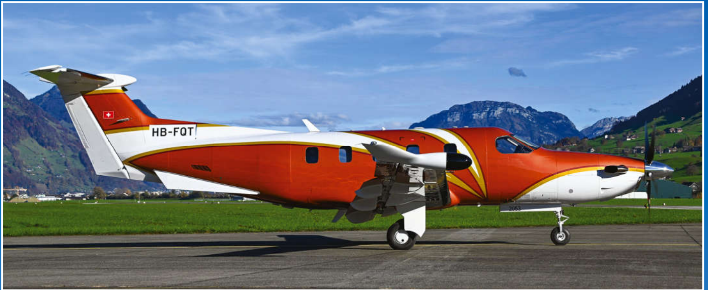
A colourful PC-12 to kick off this Pilatus-page. HB-FQT is c/n 2053, the future identity is yet unknown. (2 November 2020)