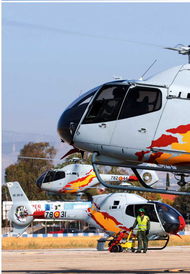
A "stack" of three EC120Bs of Ala78/Esc782 at Granada-Armilla during a base visit on 01 October 2020. These colourful helicopters also make up the helicopter demo team Patrulla Aspa.

As winners of the coveted NSK trophy in 2019, Scramble has the honour of organising the next edition of the Nationale Spotters-Kampioenschappen. Normally speaking, that would happen at the end of the year. But, and here is that recurring theme of 2020 again, due to COVID and the local restrictions in the Netherlands, we have decided to cancel the 2020 edition altogether. It was not an easy decision to take, but we aim to organise the next Aviation Day (which includes the NSK) in 2022!