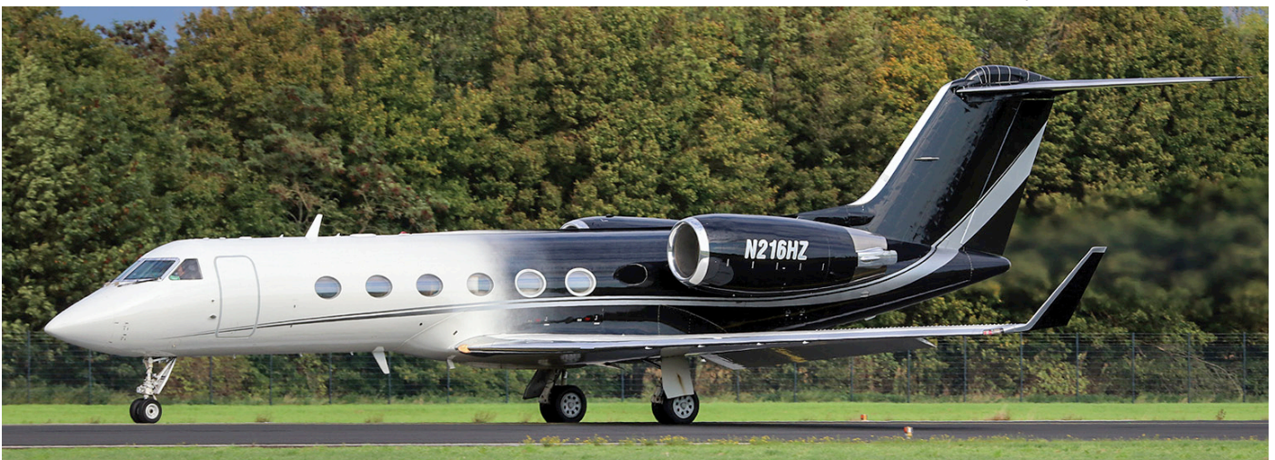
Gulfstream G-IV N216HZ is operated by Las Vegas based Newport Executive Transportation since 2019. (Rotterdam - The Hague, 9 October 2020,)