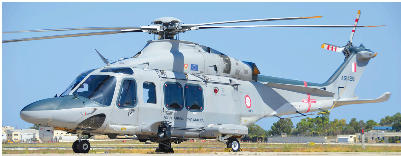
The year 2016 was a milestone for the Armed Forces of Malta because the very first mission with a completely Maltese crew was flown, with an AW139. This shiny ASI428 was framed by author Rene Slegers on 31 August 2020.

The AFM is patrolling a very large area around Malta: 60 kilometres to the north (to Sicily, Italy), 800 kilometres to the east (to Crete, Greece), 350 kilometres to the South (to Libya) and 300 kilometres to the West (to Tunisia). Italy and Greece are very helpful when the AFM reports an illegal immigrant