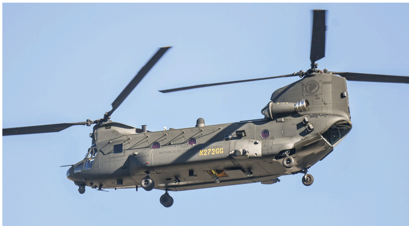
The second CH-47F Chinook for the Republic of Singapore Air Force, serial 88161 and test registration N272GG, was photographed by Vincent Games during a test flight near Wilmington/New Castle (DE). (18 November 2020)