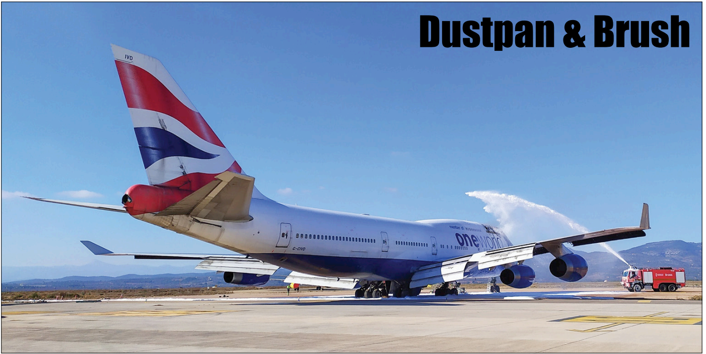
Parked at Castellón Airport, Spain, since April 2020, this British Airways Boeing 747 G-CIVD (with OneWorld titles) caught fire when a technician was cutting an oxygen line on the flight deck and sparks from the cutting wheel were caught by insulation material. Technically, it is not being broken up yet, but given it will be broken up soon, this will go down as a write off.