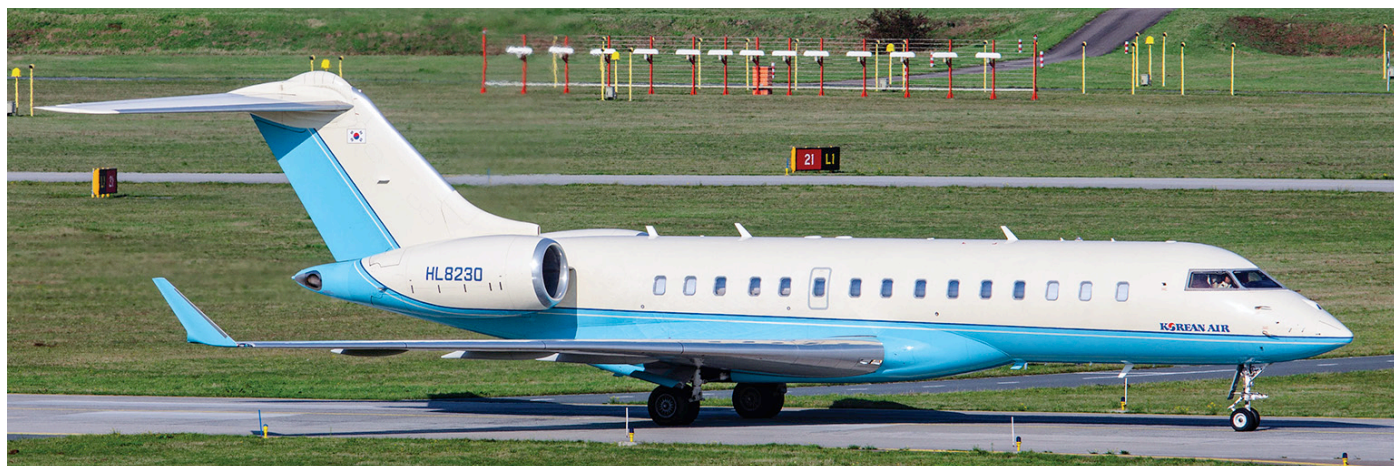
Eindhoven does not see many Korean Air visits. The arrival of Global Express XRS HL8230 did attract some attention. (Eindhoven, 9 October 2020, Luca Neggres)