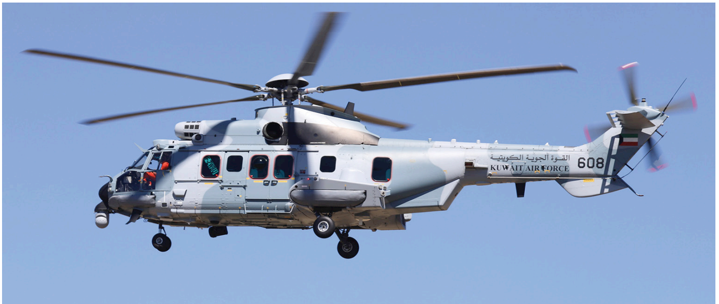
Pandemic or not, Airbus helicopter production at Marseille continues apace. One of the orders being worked on at this moment is for Kuwait, which ordered about two dozen H225Ms. Future serial 608 was noted by Alan Macey at its place of birth on 31 August 2020 as F-ZWBU.

Force Museum; only four Buffalos are left in service.