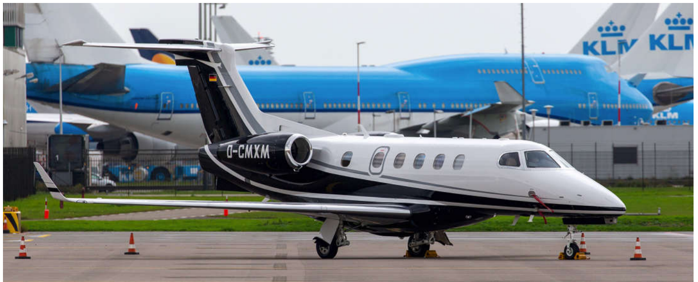
D-CMXM is the newest of five Phenom 300s operated by Air Hamburg. It joined the fleet in June 2020 and is one of 36 aircraft flown by Air Hamburg. (Amsterdam-Schiphol, 15 November 2020)