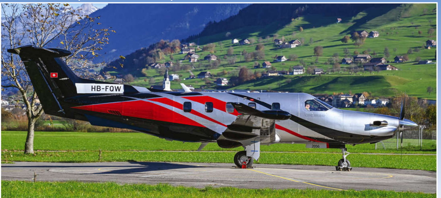
The last colourful PC-12 is the HB-FQW, which will become N856SM. (2 November 2020)