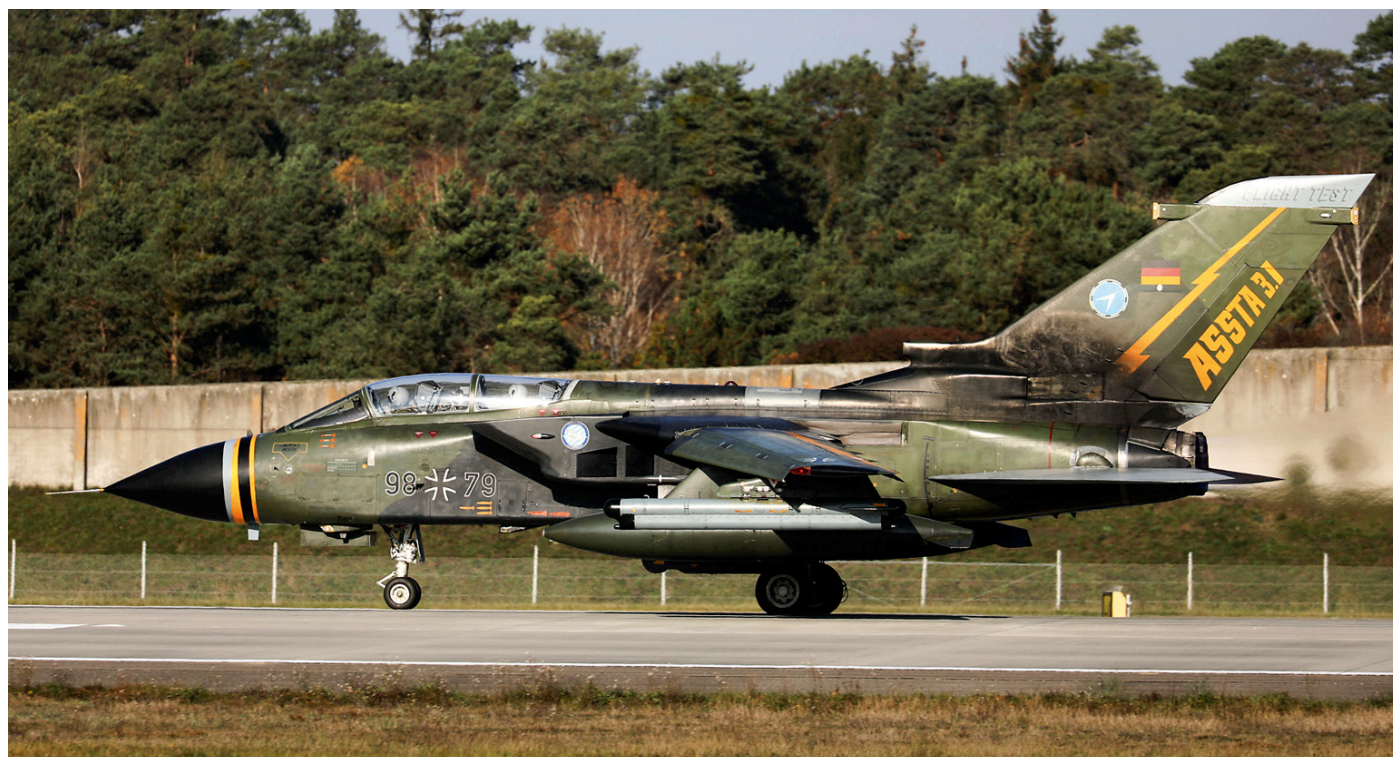
Tornado ECR test aircraft 98+79 of WTD61 was seen lining up on the runway of Manching on 5 November 2020, still wearing its ASSTA 3.1 markings but already flying for the ASSTA 4.1 upgrade program. This Tornado was actually the only German Tornado that was converted from IDS to ECR.

During the UN mission, one IAR330 was damaged at Douentza base. The Puma from the Carpathian Pumas Detachment was damaged by a storm on 10 August 2020. Two helicopters were conducting a reconnaissance mission and had landed for refueling at the UNO Base at Douentza. A sudden storm unfolded and one of the two helicopters was blown over. This helicopter was transported home on board a Boeing C-17A Globemaster III on 23 October 2020.