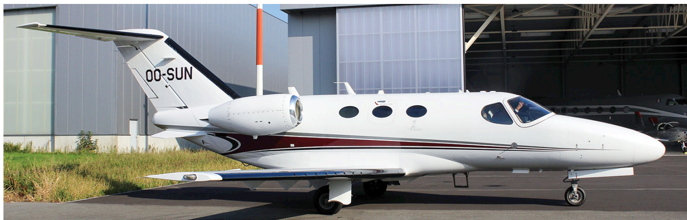
OO-SUN was one of two Citations that were added to the Air Service Liège fleet this month. The Cessna 510 Mustang was previously registered as D-IUNQ. (Antwerp, 17 October 2020,)