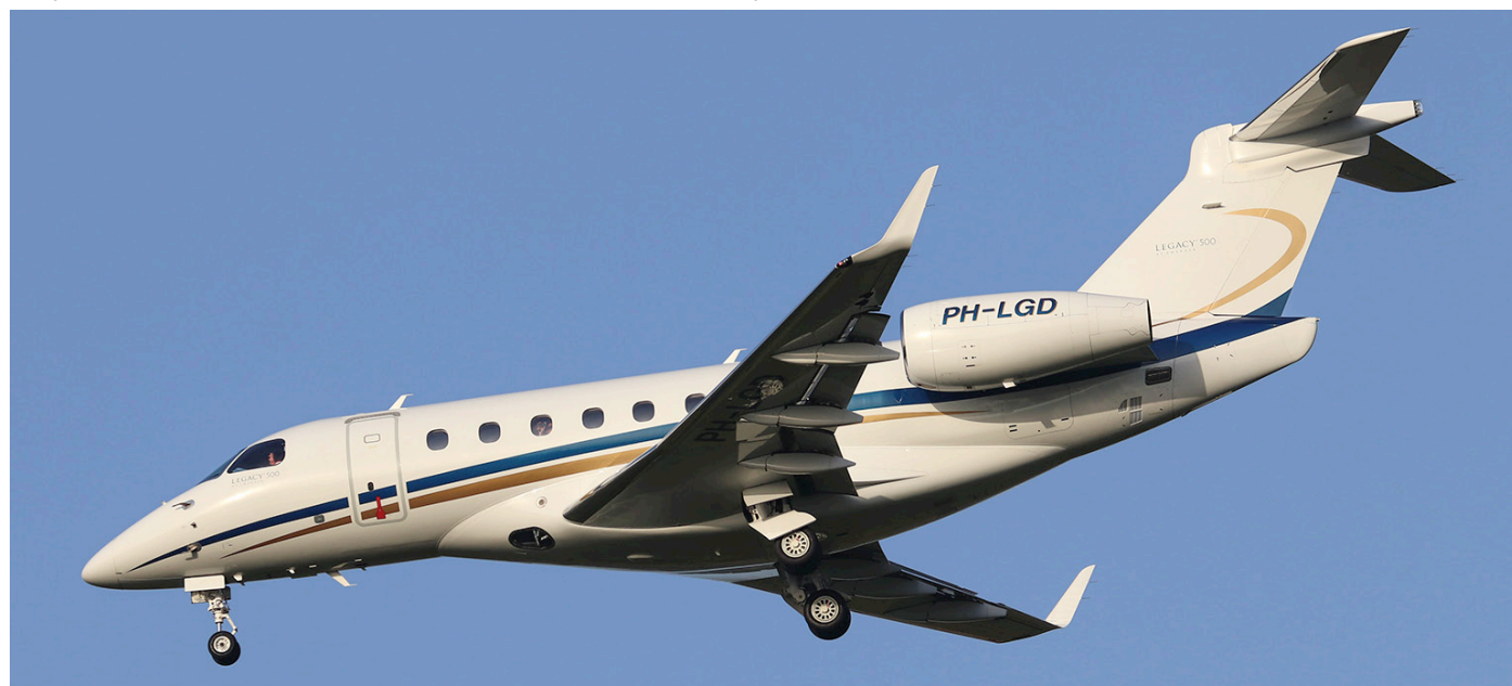
Seen here arriving on its delivery flight at Eindhoven is Legacy 500 PH-LGD. This is the first Legacy 500 to enter the Dutch register and flies on the AOC of Air Service Liège. It replaces Cessna 525B PH-FJK, which was previously based at Eindhoven. (7 November 2020, Toon Cox)