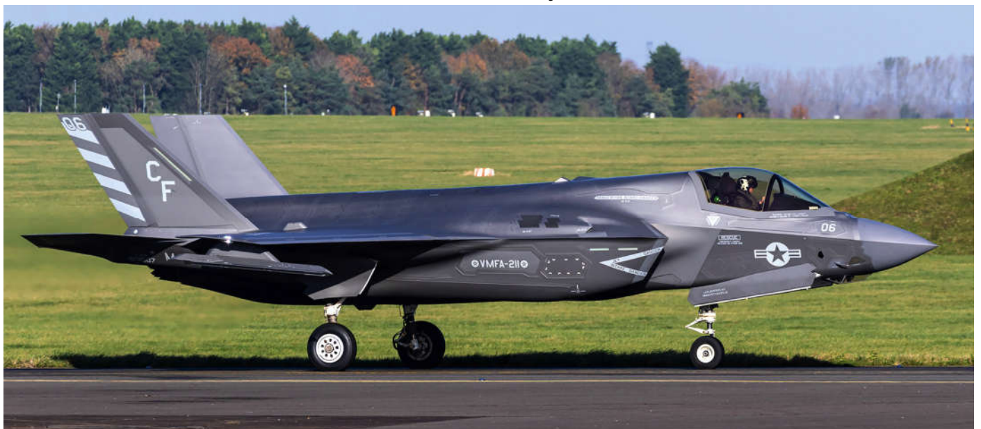
Lastly, deployed US Marine Corps F-35B 169607/CF-06 of VMFA-211 participated in Crimson Warrior at Marham and flew a mission with its RAF buddies. (4 November 2020,)