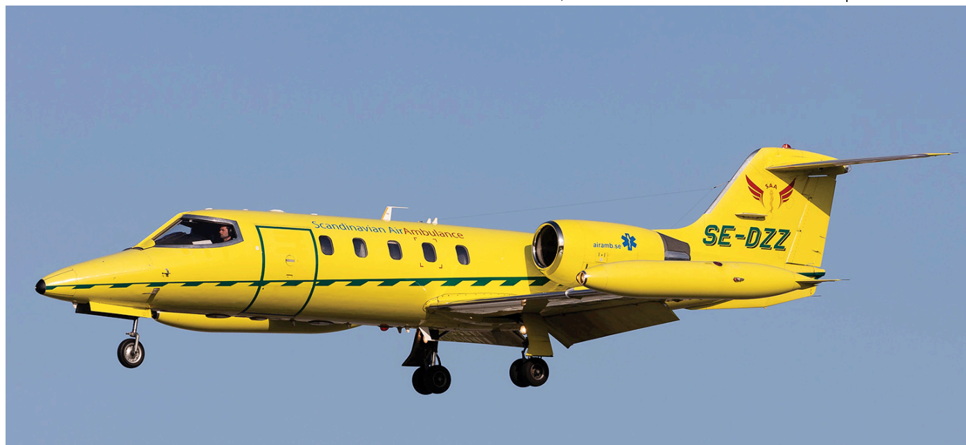
Scandinavian AirAmbulance is a service provided by contractor company Babcock to the governments of Sweden, Norway and Finland. The headquarters is located at Stockholm-Arlanda. Learjet 35A SE-DZZ is one of nine fixed-wing aircraft and the sole Learjet in service. (Stockholm-Bromma, 17 September 2020, André Alders)

100008/008 Tp100C 72 ASC sq 9H-LEO Ce550 CS-DXX Ce560XLS NetJets Europe CS-LAS Ce680A NetJets Europe D-CNOC Ce560XLS Atlas Air Service ES-JFA SA227AC JP Air ES-NSD Saab 340B Nyxair ES-NSF Saab 2000 Air Leap OE-HWM G280 AFS Alpine Flyservice SE-CCX CV-440 Linjeflyg SE-DZZ Lj35A Scandinavia AirAmbulance SE-ISG, SE-KXI Saab 340B Air Leap