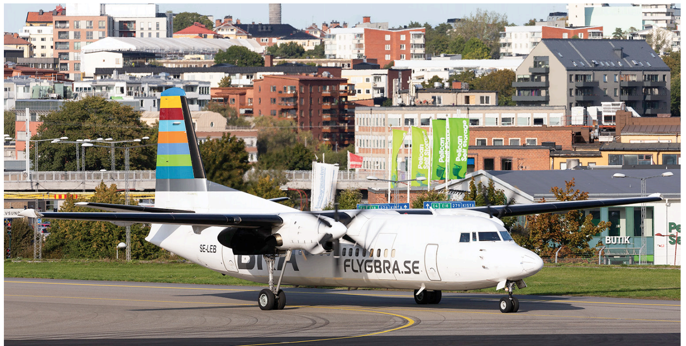
This photo of SE-LEB, a Fokker 50 operated by Amapola Flyg (and in Flygbra.se colour scheme) is showing how close Bromma airport is within the Stockholm city limits. (17 September 2020)