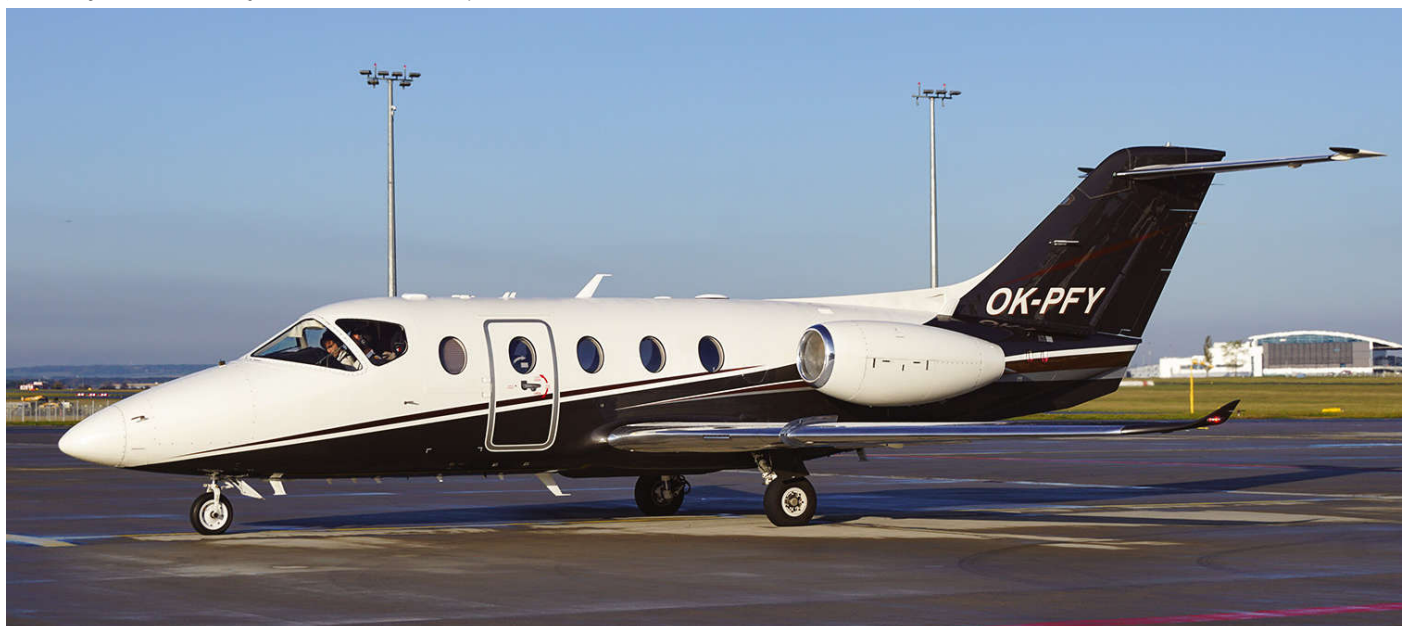
Flexjet's European subsidiary has recently sold off most of its Nextant 400s. A couple of these were sold to Czech-based Time Air, with OK-PFY being former G-FXRJ. (Prague, 24 October 2020, Václav Kudela)