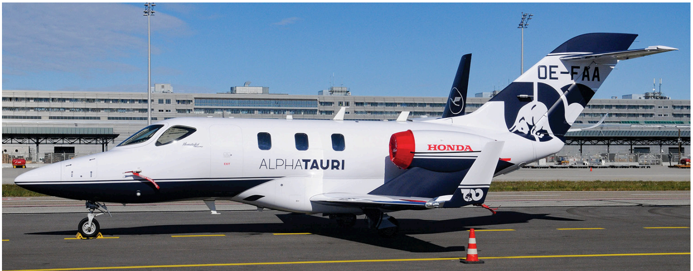
OE-FAA is the first HA-420 on the Austrian register and is operated by The Flying Bulls. The HondaJet Elite carries the titles of the AlphaTauri F1 team, Red Bull Racing's sister team which was formerly known as Toro Rosso. (Munich, 4 October 2020)