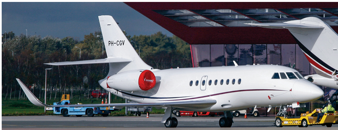
Air Alsie is a well-know Danish bizjet management company. They entered the Dutch register in September 2020 when Falcon 2000LXS PH-CGV was delivered. (Amsterdam - Schiphol, 26 October 2020,)