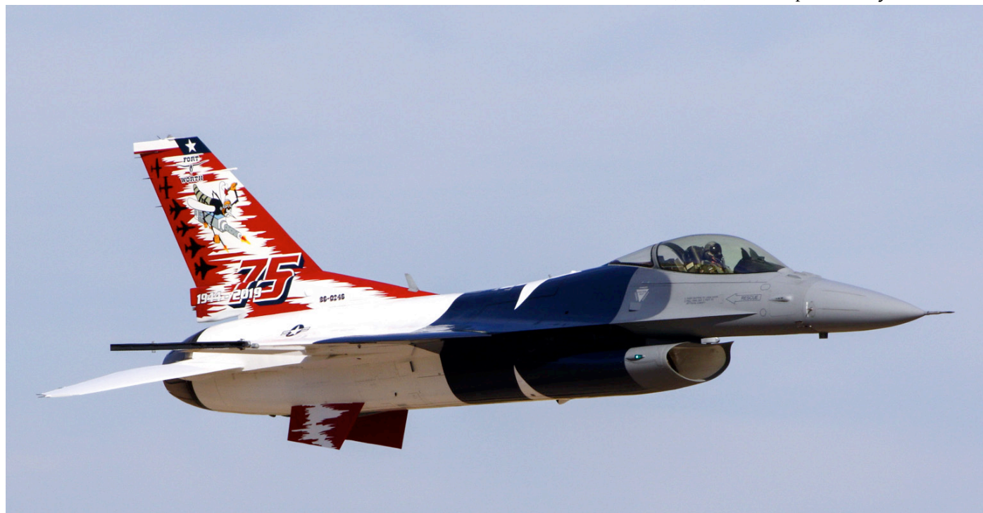
This must be one of the most colourful USAF F-16 paint schemes seen over decades of service life, 86-0242 of 457th FS celebrating 75 years of existence.

On 5 November 2020, the 23rd Wing and 347th Rescue Group (347th RQG) received the US Air Force's first two HH-60W Jolly Green IIs. The Jolly Green II will be based at Moody AFB (GA). Since the beginning of August 2020, the USAF's newest Combat Search And Rescue (CSAR) helicopter has been undergoing developmental and operational testing with the 413th Flight Test Squadron at Eglin AFB (FL) and now they are assigned to an operational squadron. The two helicopters, serials 14488 and 14489 (fiscal year most probably 2019) are part of the seven HH-60Ws already delivered to the USAF. The first delivery to the 41st Rescue Squadron Jolly Green at Moody marks the way to further deliveries, including a near future delivery to the second unit, the 512th Rescue Squadron at Kirtland AFB (NM). The USAF plans to buy 113 HH-60W