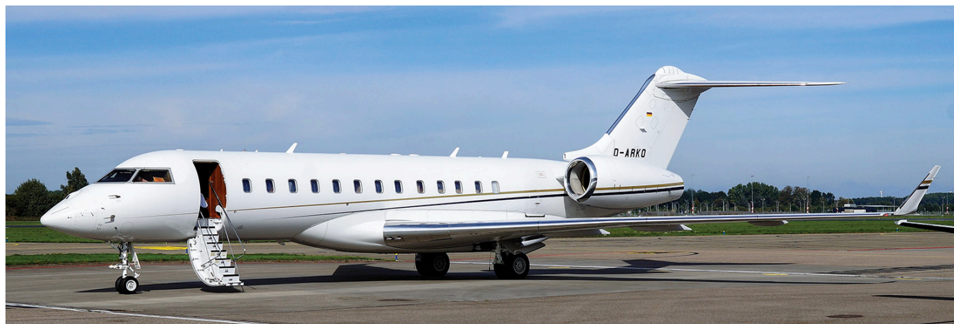
Global Express XRS D-ARKO was ferried to Lelystad for paint work. We usually show you the end result but the aircraft departed all white so this is the before photo. Operator K5-Aviation apparently needs some colourful inspiration. (Lelystad, 2 October 2020, Jan Bekker)