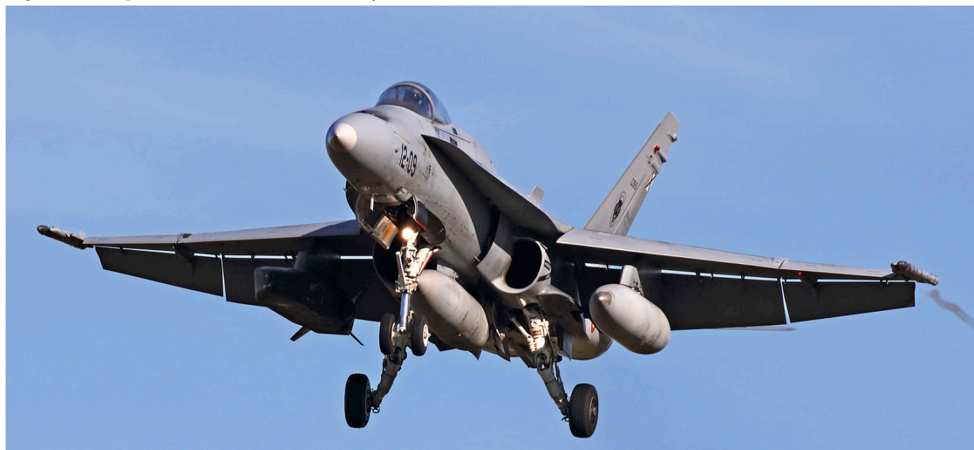
Next to the Luftwaffe (German Air Force), also the Spanish Air Force is a future operator of the stealth Taurus air-launched cruise-missile. The first EF-18M carrying the Taurus missile was EF-18M C.15-51 of Ala 12. To train the performance of the Hornet in combination with the missile, this Hornet visited the Manching testfacility last November 2020. (18 November 2020,)

The outline of the badge of 12 Herikopotatai was still visible.