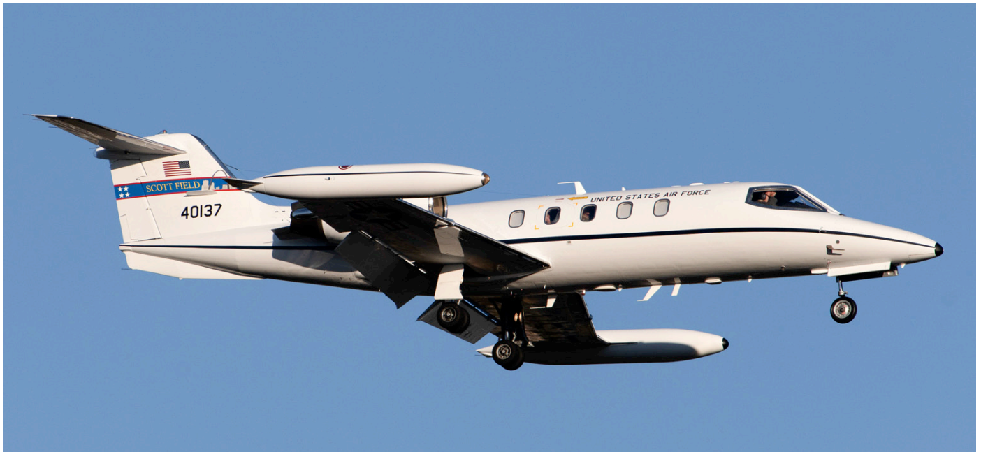
C-21A 84-0137 is seen arriving at Andrews AFB (MD) from its home base Scott AFB, also functioning as MidAmerica Airport, near St. Louis in Illinois. Using callsign Spar83, the aircraft was showing off its new tail flash, featuring St. Louis' famous Gateway Arch. The sleek Lear is in its 15th year with 458th AS. (6 November 2020,)