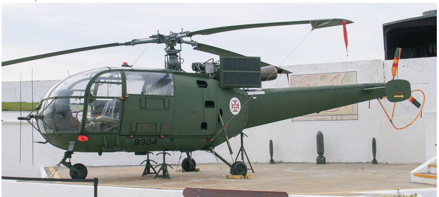
Alouette 3 19304 was handed over to the Museum of Combatants at the Fort of Bom Sucesso in the harbour of Lisbon on 5 November. This museum also has the forward fuselage of G91R/4 5420 on outside display.

Jet Art Aviation took delivery of a Lynx from Everett Aero on 19 November 2020.