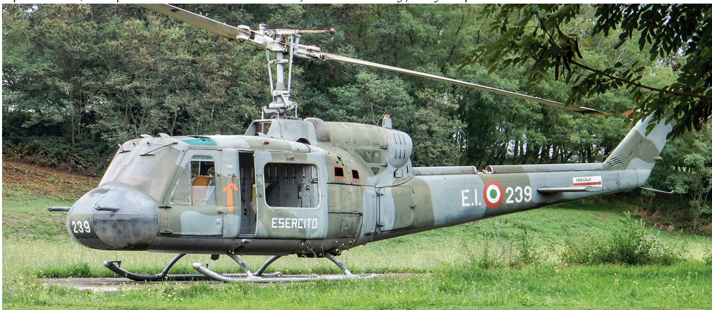
AB204B (MM80393)/EI-239 sits on a concrete patch at the Scuola di Fanteria di Cesano. It is visible from outside the barracks. (Cesano, 25 September 2020, Hans van der Vlist)