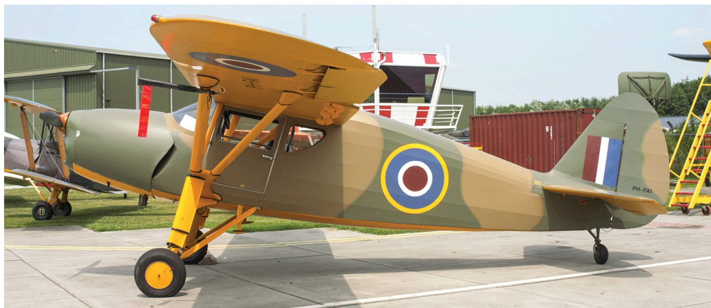
On the previous page we reported on the restoration project of Fairchild F24 N81255 at Hoogeveen airport, in the Netherlands. For those of you who are not aware of how such an aircraft looks like: here is a photograph from our files of another Dutch Fairchild Argus, PH-FAI. This machine is a long time resident of the Early Birds Foundation at Lelystad airport. PH-FAI was restored to airworthy condition and is flown in RAF livery with serial FS537. Its wheels are nowadays covered with spads. (Lelystad, 5 July 2008, Gert Jan Mentink)

The curtain has fallen for De Havilland Sea Vixen FAW2 G-CIVX (XP924). Owner Navy Wings has recently taken the difficult decision to cease the activities aimed at returning