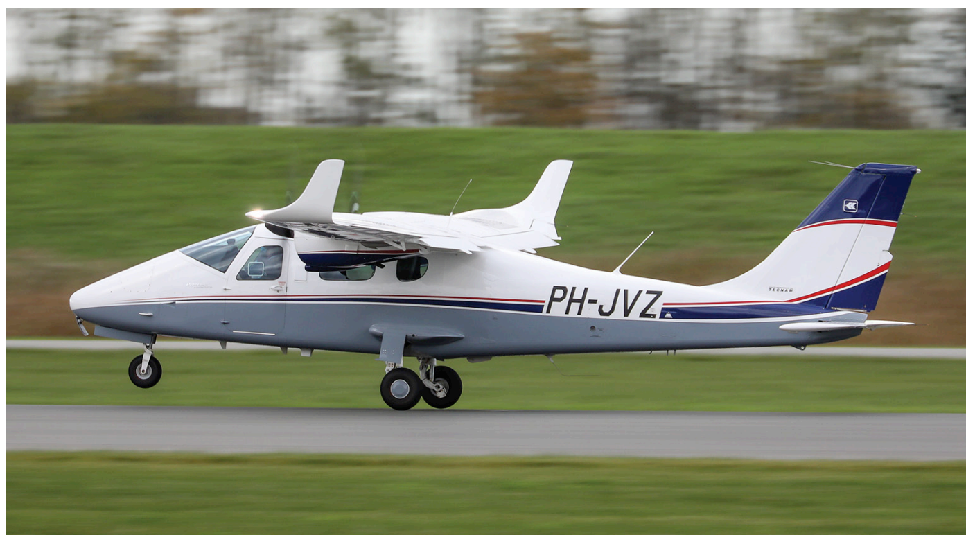
PH-JVZ arrived at Lelystad on delivery from Capua, Italy on 28 October 2020. This Tecnam P2006T is a Mk.II Premium Edition. The aircraft is owned by ZX Machines bv. (Lelystad, 3 November 2020, BJ Floor)

Credits: Inspectie Leefomgeving en Transport.