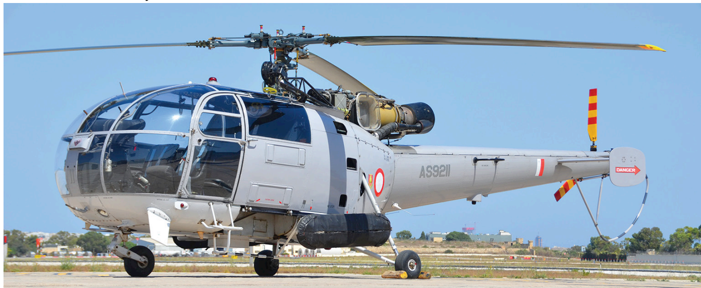
Still going strong is this ex Libyan Police Alouette 3, AS9211, which was delivered to Malta on 24 December 1992. In total, Malta received three Alouette 3s donated by Libya.

It was in 1991 that the AFM took the first steps towards acquiring fixed-wing aircraft by accepting an offer to buy five Cessna O-1E Bird Dogs from the Italian Aviazione dell'Esercito. Following that, 1992 was the year in which a lot was changing for the AFM Helicopter Flight. With the arrival of the Bird Dogs, the Helicopter Flight was transformed to Air Squadron. Notwithstanding the change in name, the Italian Guardia di Finanza donated two NH500Ms, with floats, for training purposes. Those NH500s were the first to be painted in the Air Squadron livery of white, green and high-visibility orange Day-Glo. Finally, the Libyans brought back the log books of the Alouettes and the AFM decided to give them a major overhaul in France so they could be used for SAR tasks. The