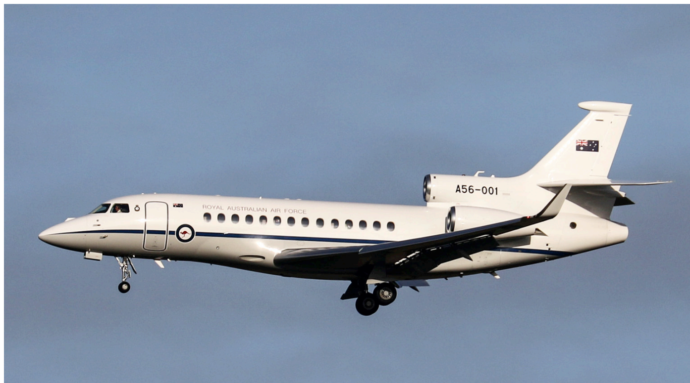
Late November, "Aussie" Falcon 7X A56-001 of 34 squadron RAAF paid a few visits to Europe and despite travel restrictions it could be caught on memory card by Paul Sanders at Brussels on 21 November 2020.