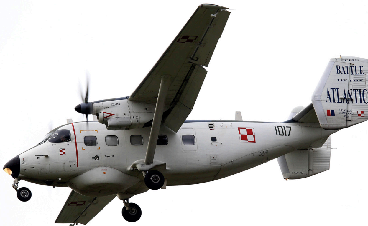
M-28B Bryza 1R 1017 is one of the active Bryza's in the Marynarka Wojenna Rzeczypospolitej Polskiej (Polish Navy). This M-28 of the 44.BLotM was photographed during landing at Dèblin and is normally based at Cewice. (21 October 2020,)