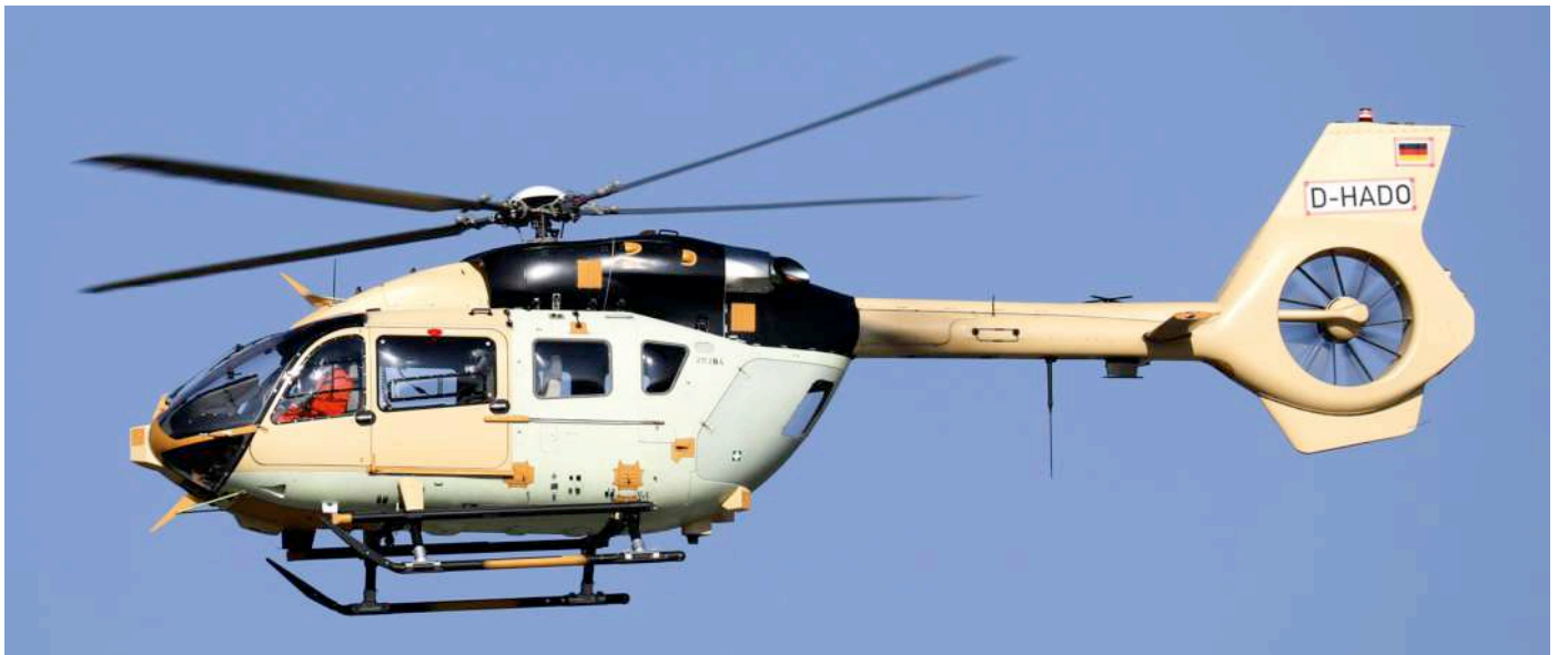
The Airbus Helicopters H145 is a very popular helicopter on both the civil and military market. H145 D-HADO (with its construction number 20284 clearly visible) was photographed at Manching during one of the many testflights which are normally performed before helicopters will be handed over to the customer. This particular example is destined for the Hungarian Air Force and its future serial will be "05". (5 November 2020, Josef Gietl)

The IAR330 is the Romanian-built version of the Aérospatiale SA330 Puma helicopter, manufactured by IAR Brasov. Romania bought a licence to manufacture the French helicopter on 30 July 1974. The first licensed built Puma was flown on 22 October 1975 under the designation IAR330L.