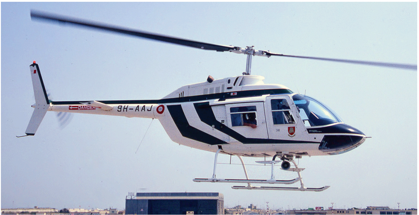
This former Libyan Air Force Agusta-Bell 206A Jet Ranger was delivered in April 1976 and registered as 9H-AAJ. The helicopter was sold on the civilian market in 1997.