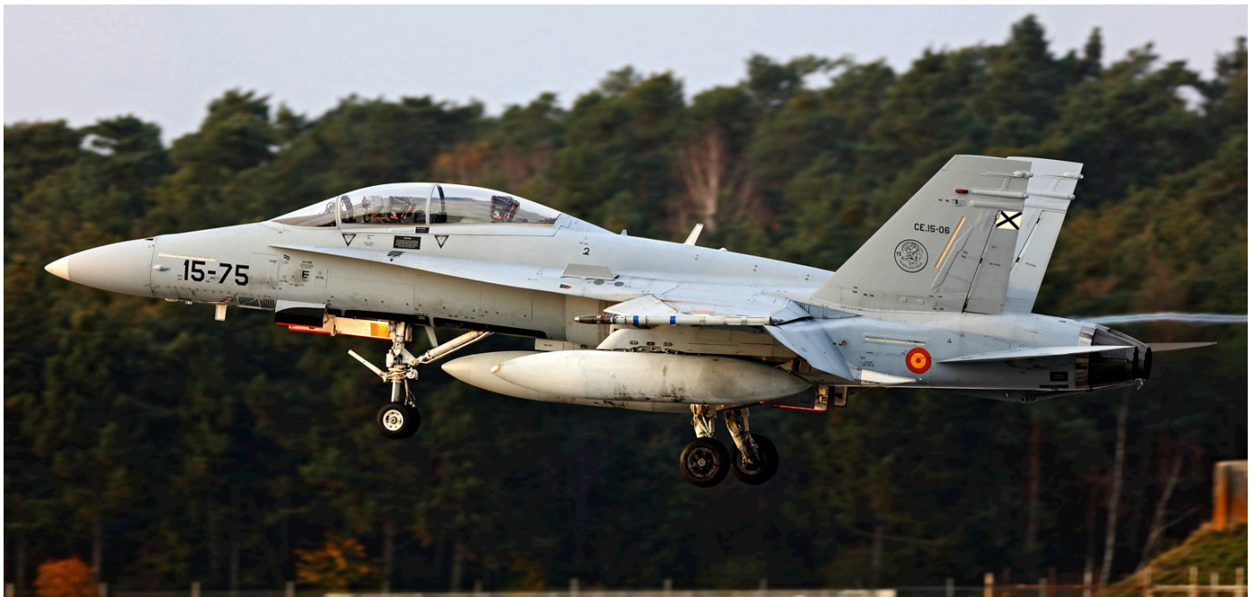
For the Taurus cruise-missile testing at Manching, EF-18M C.15-51 was accompanied by this EF-18BM CE.15-06 of Ala 15. (12 November 2020,)