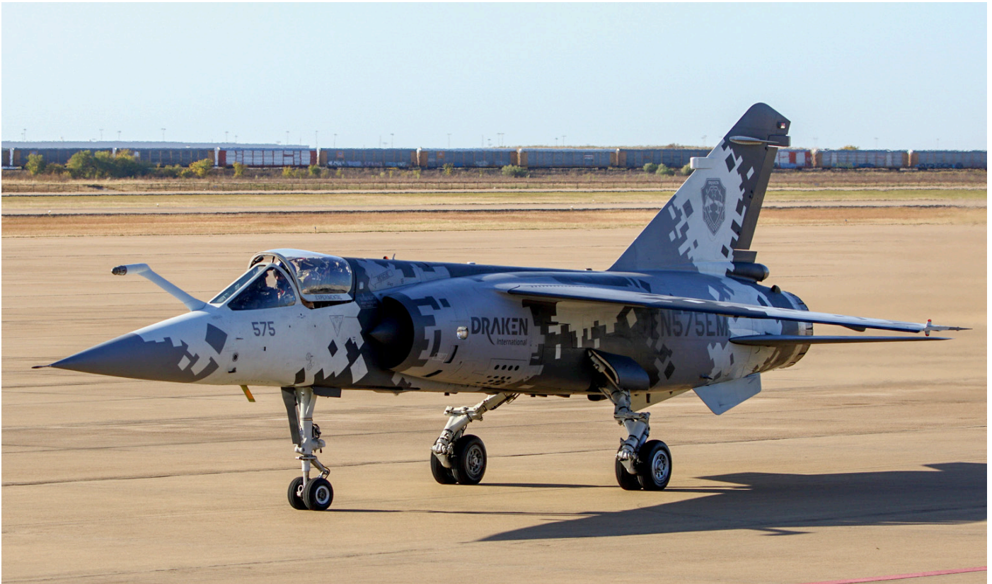
Who would have known the US is probably your best opportunity to see Mirage F1s? N575EM of Draken was captured at Fort Worth-Alliance on its way to Nellis on 05 November 2020.

and it was decided to remove all useable parts (including the classified mission equipment) and offer the remains for sale by tender.