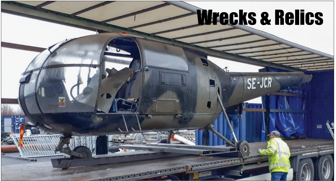
The Alouette Museum Barneveld took delivery of no less than five Alouette 3s during November. They all came from the Aerozeum at Göteborg-Säve. They were exchanged for Alouette 3 parts which will help the Aerozeum restoring their remaining Alouette 3. A-208 is the first one which will be restored. It has already lost its civil SE-JCR markings. A-208 was delivered in June 1964.