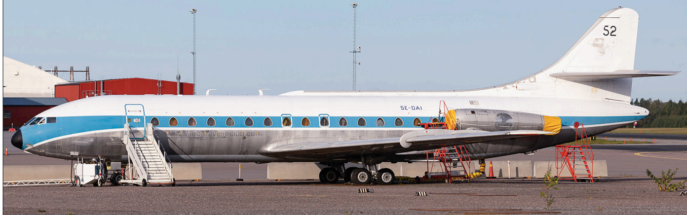
Scandinavian Airlines System took delivery of this Sud Est SE210-3 SE-DAI on 10 February 1966. In September 1971, SAS sold the Caravelle to the Swedish Air Force and was registered 85210 (code 52 still visible). In 1999, the Caravelle was withdrawn from use and registered to Le Caravelle Club on 28 January. The Caravelle reverted to the former civil registration the same day. (Stockholm-Arlanda, 18 September 2020, André Alders)